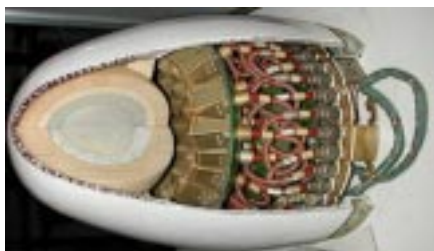
(left) Emitter array for internal SPS-171/172 electronically steerable jammer, dedesigned to focus jamming power into a narrow sector (podded L-005 depicted). (centre) Detector aperture for the MAK series infrared Missile Approach Warning System, here installed on a Bear H. (right) The ventral OBP-15T remote TV bombsight is used to target dumb bombs. The fairing for this device is well placed to fit a laser targeting system.

But today, most of the Russian Backfire fleet is grounded through lack of funds, and needed upgrades cannot be paid for. India was to lease four Backfires, and Indian press reports claimed that aircrew were despatched to Ryazan for conversion training, so an export precedent has been set. And the Russians have not discouraged competition between India and China, reflected in 'tit-for-tat' acquisitions of Su-30MK, R-77, 3M-54/3M-14E missiles, A-50 AWACS, Il-78 tankers and submarines.