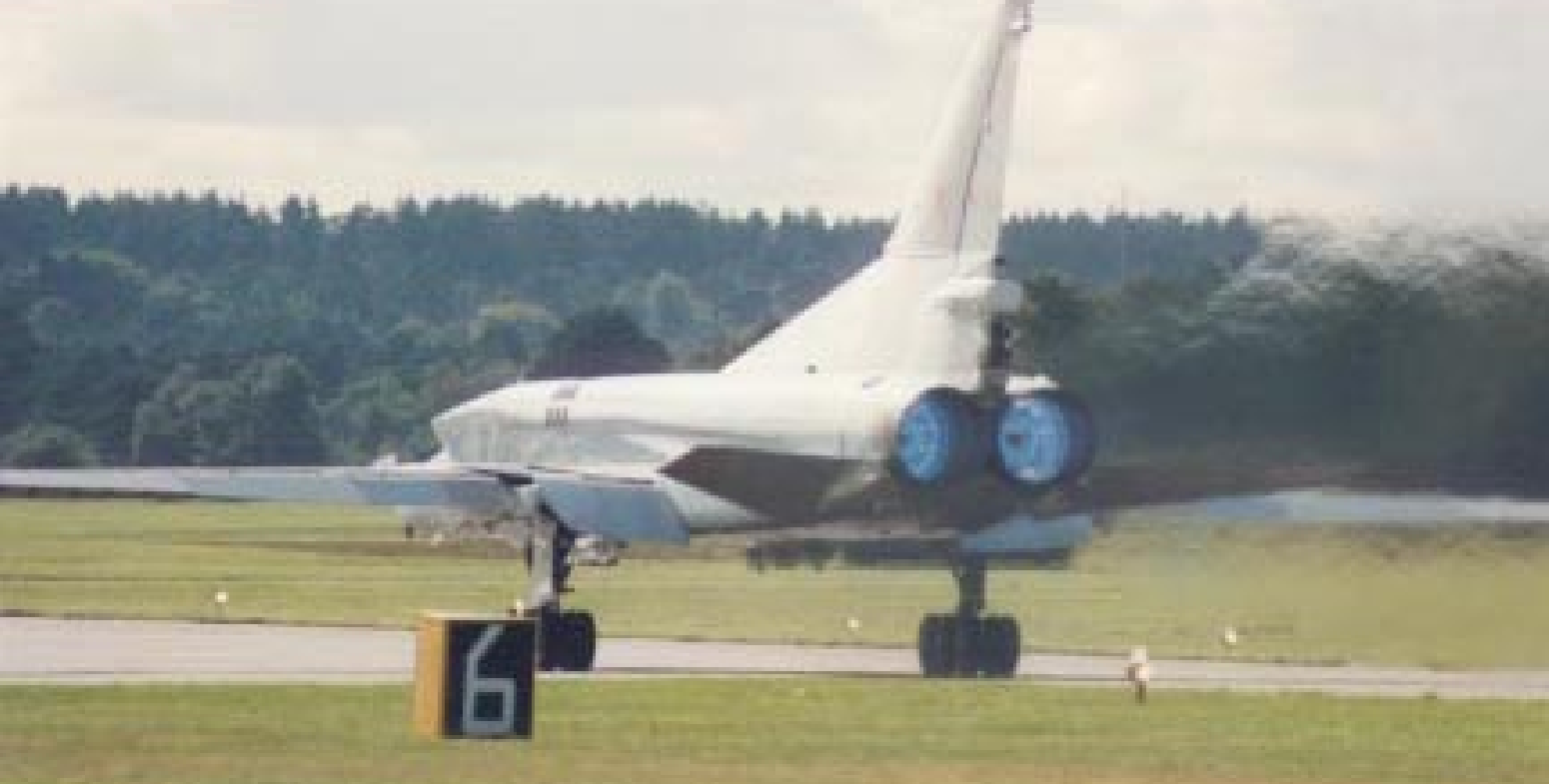
A Ukrainian air force Tu-22M-3 uses afterburner to takeoff during an airshow display. The high speed penetration profile and powerful jamming suite of the Backfire makes it extremely difficult to intercept by smaller fighters like the F-16, F/A-18 and JSF.

as against replacement with a derivative Su-30 radar will present an interesting dilemma for PLA-AF planners. The stabilised gimbal and large radome volume present considerable flexibility for retrofits.