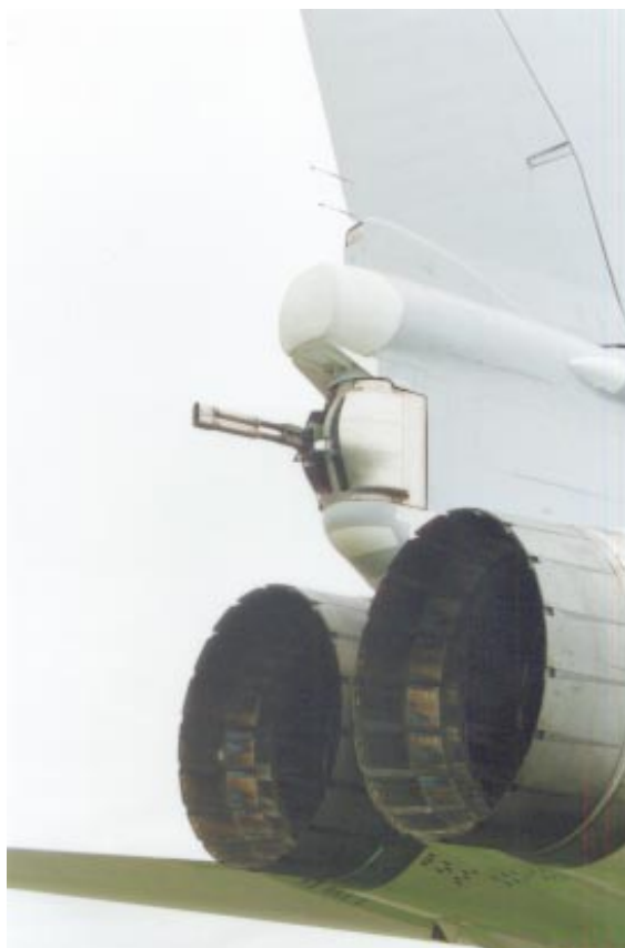
The defensive barbette on a Tu-22M-3.

It is very unlikely that Russia would export the Kh-55/AS-15 Kent strategic cruise missile or the Kh-15A/R/S/AS-16 SRAM-ski as part of an export package, although an anti-ship Kh-15 has been offered for export. Conventional variants of the Kh-22 were apparently offered to India and would not present any major issues for export. Indeed, as China operates variants of the Styx/Silkworm which use a closely related rocket engine and the same propellants, the Kh-22 would be very easy for the PLA to support and operate. We should not be surprised if the PLA opts to licence build the Kh-22 as it could be rapidly assimilated given the infrastructure to manufacture the C-601/611. The Kh-22 remains a formidable anti-shiping weapon and with precision guidance, an extremely potent land attack weapon.