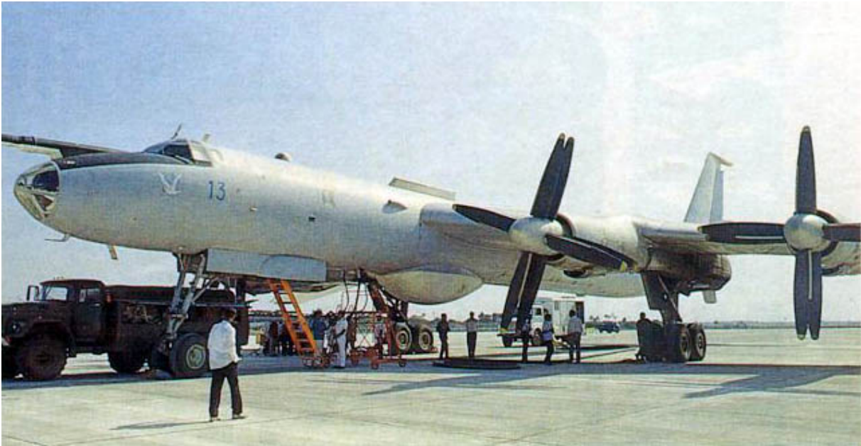
Figure 2: India is currently in the process of refitting its 6 strong force of Tu-142M Bear F with a new avionic package, reported to include either the 3M-54E/E1 Alfa or Kh-35 Uran ASCMs. It would also appear that India has signed for another 8 Bears to bring the total force up to 14 aircraft. With an unrefuelled radius of up to 4,000 NMI, the Bear becomes a formidable maritime power projection asset (Bharat-Rakshak).