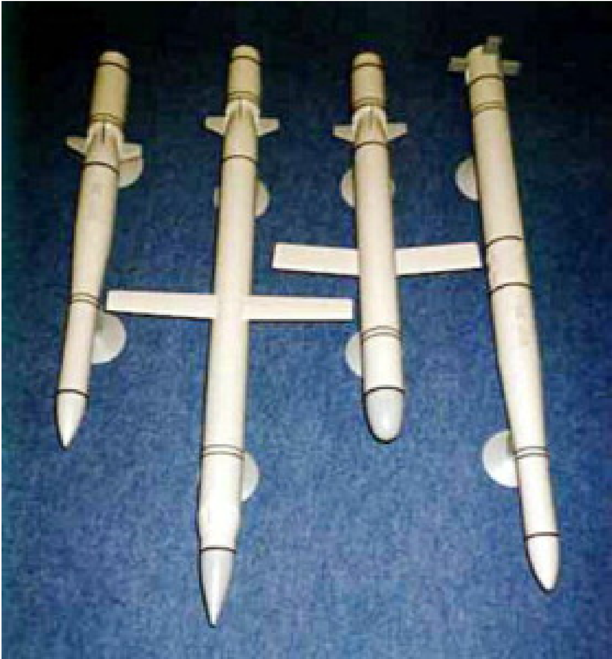
Figure 5: The most sophisticated of the current crop of Russian ASCMs is the 3M-54 Alfa series. Left to right: 91RE2 rocket propelled torp, 3M-54E 'hypersonic' ASCM, 3M-54E1/3M-14E subsonic ASCM/SLCM (TASM/TLAM-ski), 91RE1 rocket propelled torp. The 3M-54E uses a Tomahawk style cruise stage and a Mach 2.9 rocket propelled warhead section (Rosvooruzheniye).