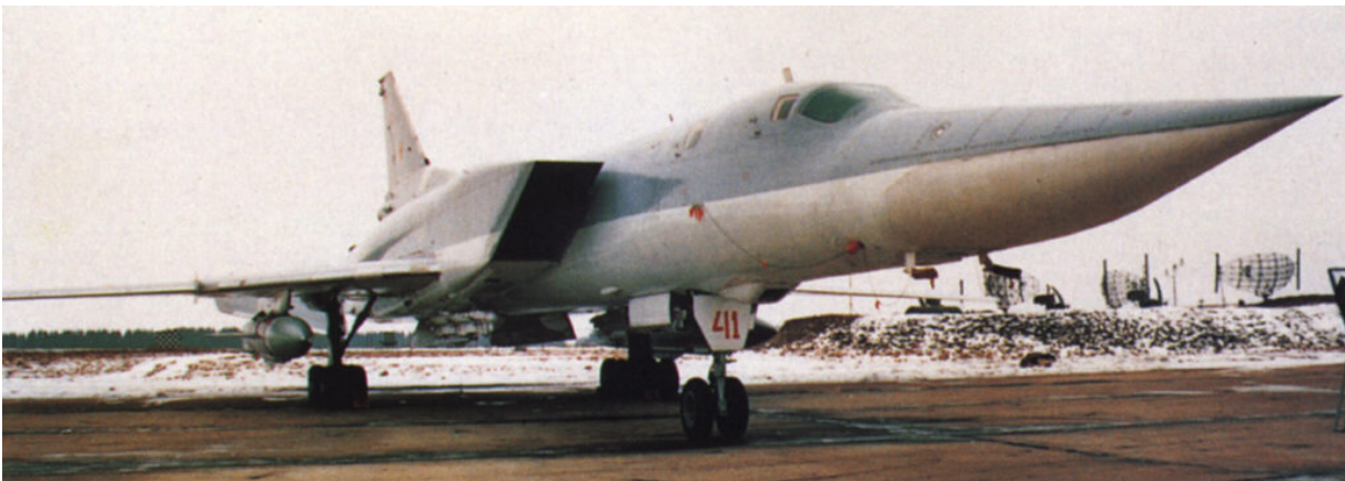
Figure 3: India is currently leasing several Backfires C strategic strike aircraft, with the likelihood of a purchase being discussed. In its basic configuration it carries either one or two Mach 3 Kh-22M Kitchen cruise missiles (depicted). Flying from INS Port Blair, the Backfire can cover the WA and NT coastline between Learmonth and Darwin (FAS).