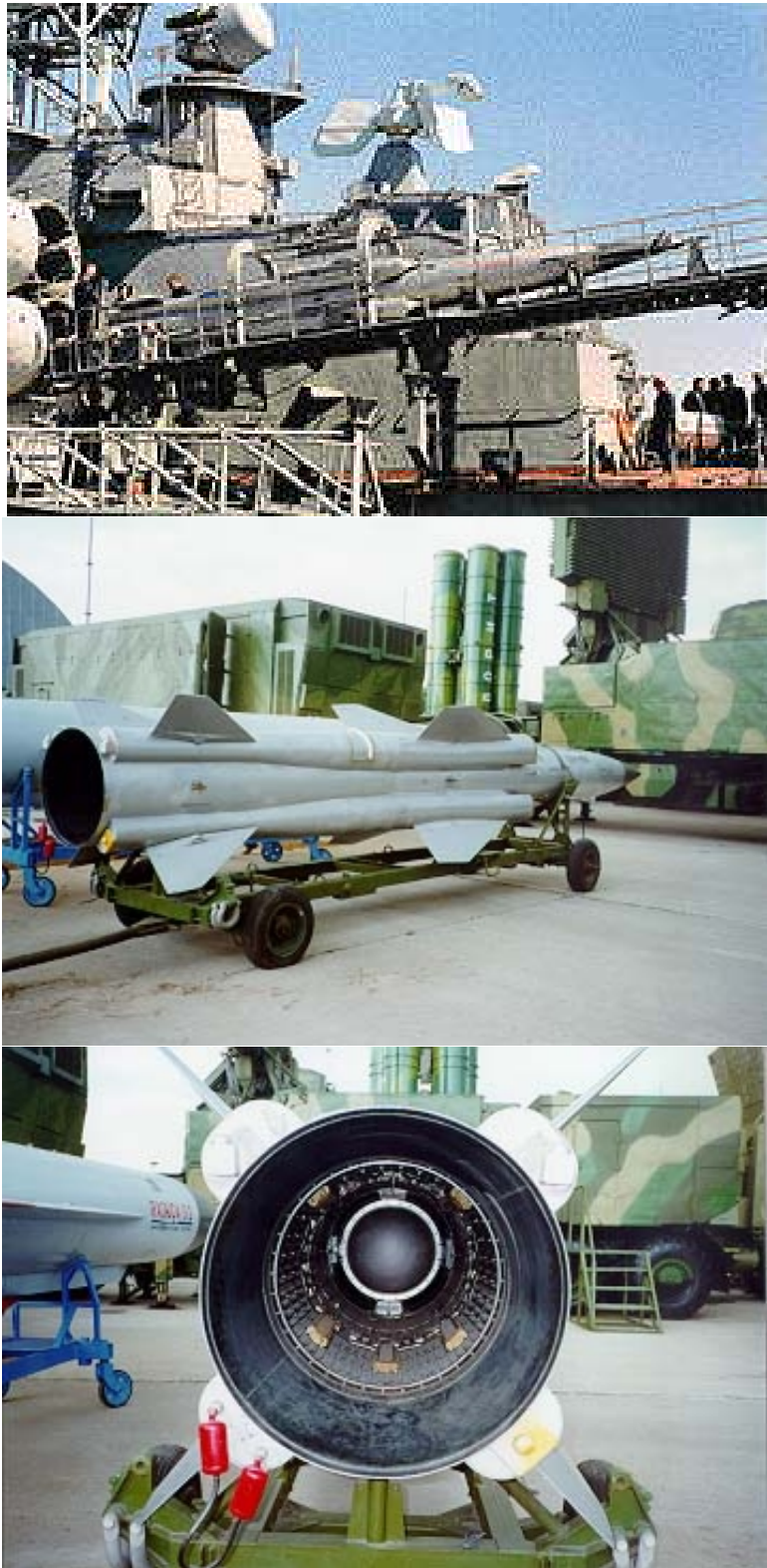
Figure 6: The massive Moskit/SS-N-22 Sunburn is available in ship, sub and air launch versions, the latter compatible with the Su-30 and Su-32FN/34 Flanker variants. This Mach 2 ASCM is carried by the PLA-N's four Sovremennyy class DDGs, each of which is armed with 8 rounds (Rosvooruzheniye).