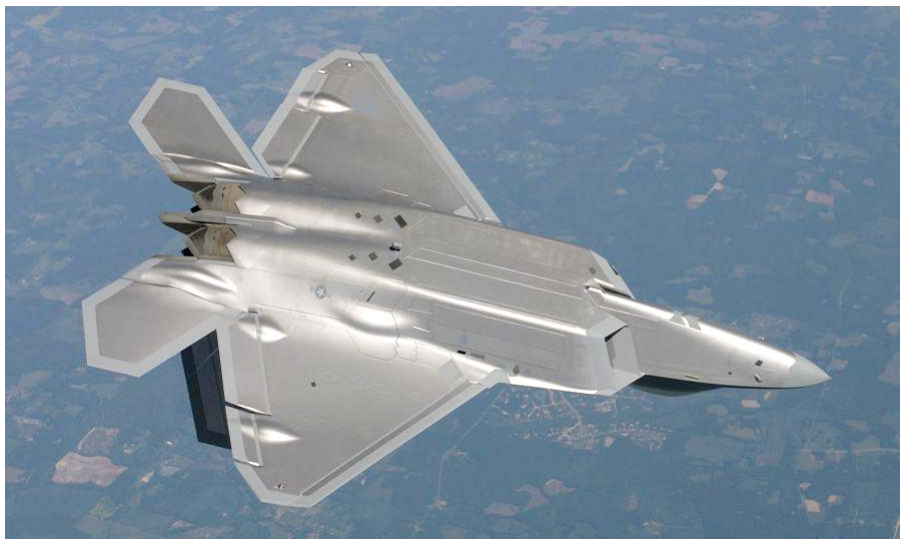
This photo shows in detail the F-22A's stealthy engine exhausts, weapons bays, radar absorbent leading edge treatments and generally smooth lines.

Perhaps the final word on the aircraft's capability should go to the USAF's ACC commander. "Lamentably, we have never been privileged to hold a weapon like this in our hands," said General Keys at the F-22's IOC cer-