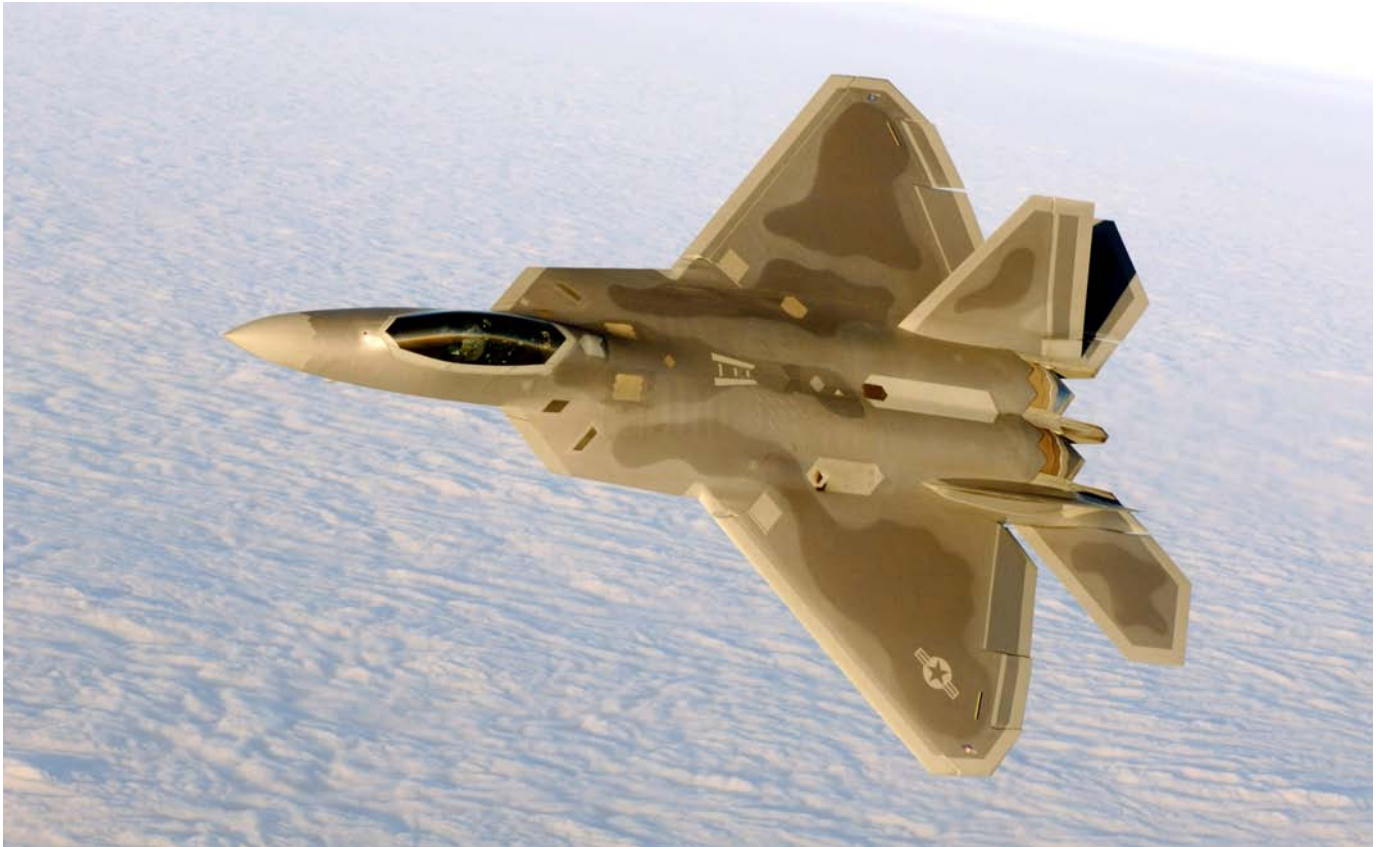
The F-22 has an intuitive cockpit layout which supplies Raptor pilots with an abundance of information. The biggest challenge for pilots is when to access the information and how to best use it.

next day.” LtCol Tolliver has 13 years of experience flying F-16C Block 30, 40 and 50 fighters, and had a year on F-15Cs before converting to the F-22 in mid 2004.