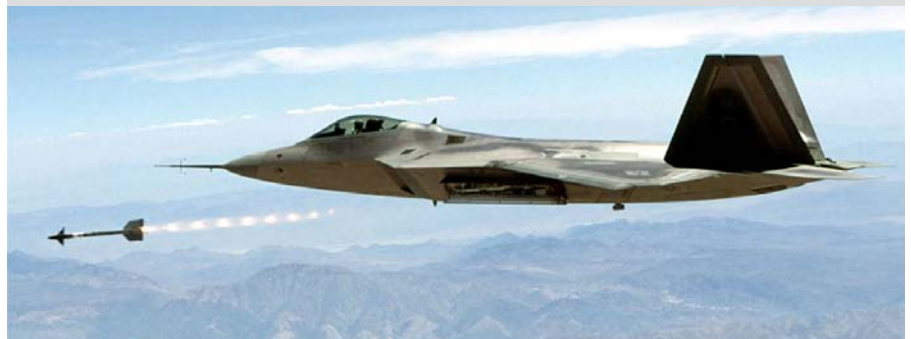
An Edwards based F-22 fires an AIM-9M Sidewinder during testing.

"When the OT (T&E) guys first got the airplane, there were still a lot of problems with the avionics," Major Charles 'Corky' Corcoran from the 27th FS told Australian Aviation . "The stealth, engines, and FCS (flight control system) were all good, but there remained some challenges with the maintenance and integration of the avionics." Major