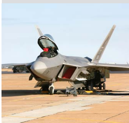
A 27th FS Raptor being readied for flight.

"The biggest challenge in flying the Raptor is information management," LtCol Tolliver continued. "All the data is at your disposal – you just need to know when to access the information and how to use it. For conversion, because there's no two-seater, you do eight-to-nine simulator flights before your first flight. And before you do your first flight, we suit you up and take you out to the jet and do all your ground checks in a dummy run as if you were going to fly. Your first flight won't just be a jaunt around the airfield; it's a full mission where you explore the AHC (advanced handling characteristics), and then perform four-to-five practice landings when you return to base.