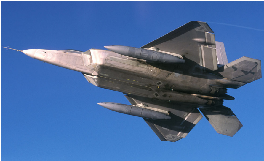
The Raptor has four external hardpoints (two under each wing) for the carriage of auxiliary fuel tanks (pictured), JDAMs, air-to-air missiles, or a combination of all three. External stores are only used for ferry flights or once air dominance has been assured as they disrupt the aircraft's low observability.

The YF-22/YF119 combination was declared the winner of the ATF evaluation in August 1991. The Lockheed/GD/Boeing team and Pratt & Whitney were awarded engineering and manufacturing development (EMD) contracts totalling US$10.9bn, under which they would complete the aircraft's design, construct tooling and production facilities, and build and test nine airworthy and two ground test F-22s. This amount soon blew out to US$18.6bn due to congressional budget cuts and schedule changes.