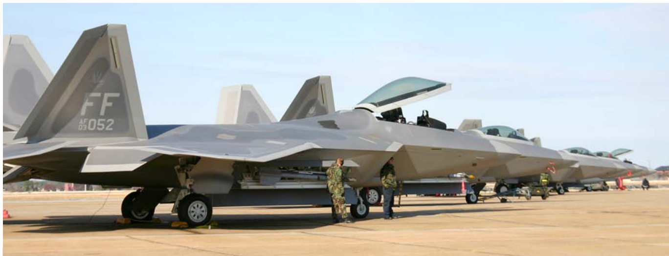
The 27th FS flightline at Langley Air Force Base. The 94th and 71st FSs will follow the 27th in converting from the F-15C to the Raptor, with Langley expected to be home to some 72 F-22s by the end of 2007.