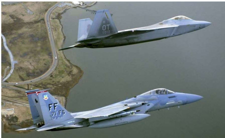
A 1999 report showed the in-production F-22 was projected to cost at least three times as much as the US$55m (A$74m) F-15 it was designed to replace.

With an hour in a simulator the author couldn't possibly equate to what it's like to really fly the world's best fighter, especially as the simulator was no doubt 'detuned' for visitors not cleared to know what the F-22 can really do.