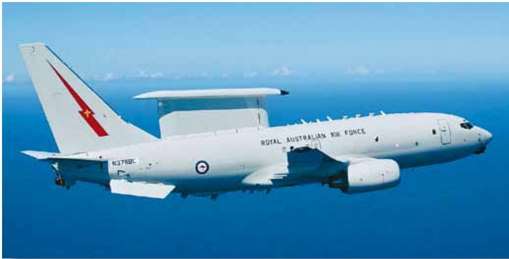
Boeing Wedgetail AEW&C.

“ The notion that the United States will be able to plug all and any ADF capability gaps was at best dubious a decade ago, and given the downsizing of the US force structure currently in progress, qualifies at best as fantasy now. ”