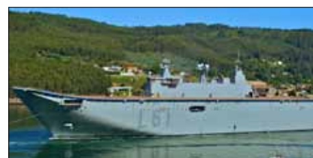
The Juan Carlos I LHD on sea trials.