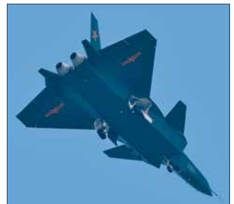
At this time there are no planning measures for the ADF to deal with advanced non-US stealth aircraft which will be operational in the region well before 2020.