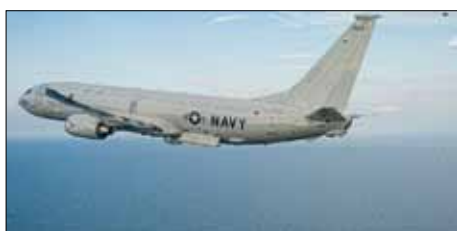
Enhanced ASW capabilities will be important in coming decades.

Current planning for future ASW capabilities is yet to be resolved in key areas, such as the choice of a future submarine type. The new ASW helicopters are a good fit, and the intended P-8A Poseidon and MQ-4C BAMS Global Hawk are also good