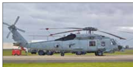
The Canberra class LHDs have significant potential to perform as ASW helicopter carriers if suitably adapted. Depicted a US Navy SH-60R Sea Hawk.