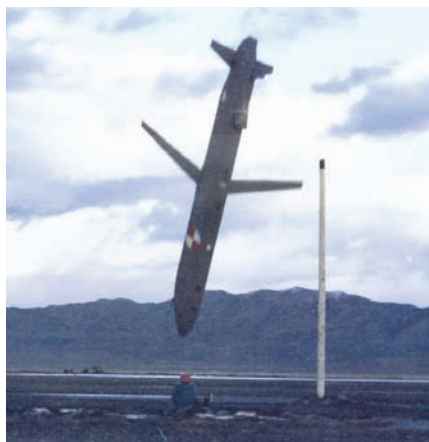
The now operational WAGE system was used for trials of the enhanced AGM-86C Block II cruise missile.

Measuring these errors accurately can present interesting technical challenges, but the plus is