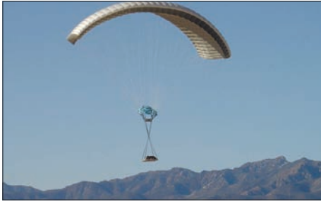
The Joint Precision Airdrop System (JPADS) uses GPS and steerable parachutes to provide extremely high accuracy compared to traditional airdrop deliveries.