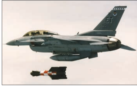
The US Air Force EDGE High Gear program trialled an extremely accurate Wide Area Differential GPS scheme for weapons guidance. Depicted images from drops of modified GBU-15 glidebombs, using only differential GPS guidance.