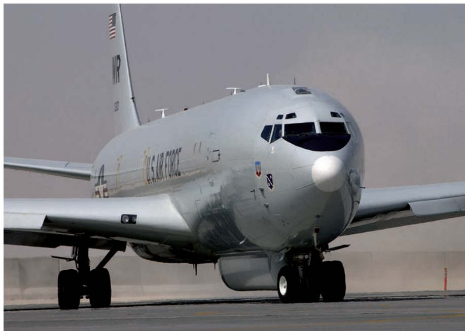
This E-8 JSTARS provides unprecedented capability to collect battlefield ISR product using its large Synthetic Aperture / Moving Target Indicator radar system. It has poor survivability against 160 – 240 nautical mile range "Counter ISR" Surface to Air Missiles.

Another emerging problem is lower resistance to jamming, in contested battlespaces. This has not been an issue in COIN campaigns since opponents lack the means of defending jammers, and often lack the technological literacy to even understand such. However, nation state opponents are typically