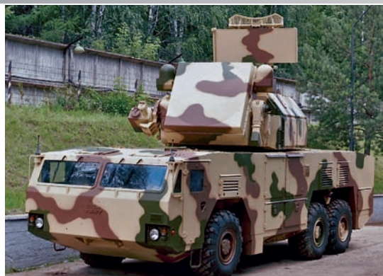
Advanced point defence SAM systems such as the Tor M2E / SA-15 Gauntlet (right) and Pantsir S1 / SA-22 Greyhound (below) present a genuine survival risk for nearly all contemporary battlefield ISR platforms, be they RPVs or helicopters.

Political and ideological fixation on COIN operations across the West was produced unprecedented complacency in the area of ISR platform survivability, just as it has produced such complacency in providing for network jam resistance.