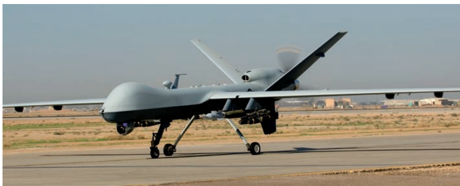
Remotely Piloted Vehicles such as this MQ-9 Reaper have proven to be highly valuable ISR platforms in COIN operations, but are unusable against nation state opponents armed with modern battlefield SAMs and fighters.

Until the 1960s the primary ISR tool was the visible light wet film camera. The Vietnam conflict brought the first thermal imaging sensors using analogue electronics and the first Synthetic Aperture Radars, using wet film rolls as a capture and storage medium. Photographic film has now been displaced by optical imaging and radar imaging systems. Visible band and infrared imagers will continue to evolve, as will radar, to better resolutions, better band coverage, and increasing ability to autonomously identify targets. Analogous growth has also occurred in passive radio-frequency sensors for signals and electronic intelligence. At the most fundamental level, physics and mathematics dictate what can be achieved using basic technology, and basic technology at any