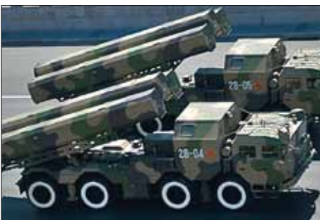
China's growing inventory of Ground Launched Cruise Missiles provides a capability which India has yet to counter.

China's growing dependency upon imported fossil fuels sourced in the Persian Gulf and Africa, as well as dependency upon raw material imports from Africa, make China critically dependent upon freedom of navigation through the Indian Ocean. Any nation in the position to constrict, interdict or indeed control the Sea Lines Of Communication (SLOC) through the Indian Ocean can put China into a precarious position, by starving its economy of energy and to a lesser extent, other raw materials. China's large investment in the construction of deep water port facilities in Burma and Pakistan is motivated in part by the lower cost of shipping between the Persian Gulf and Indian Ocean ports, but also by the ease with which the Straits of Malacca, Sunda and Lombok could be closed to shipping.