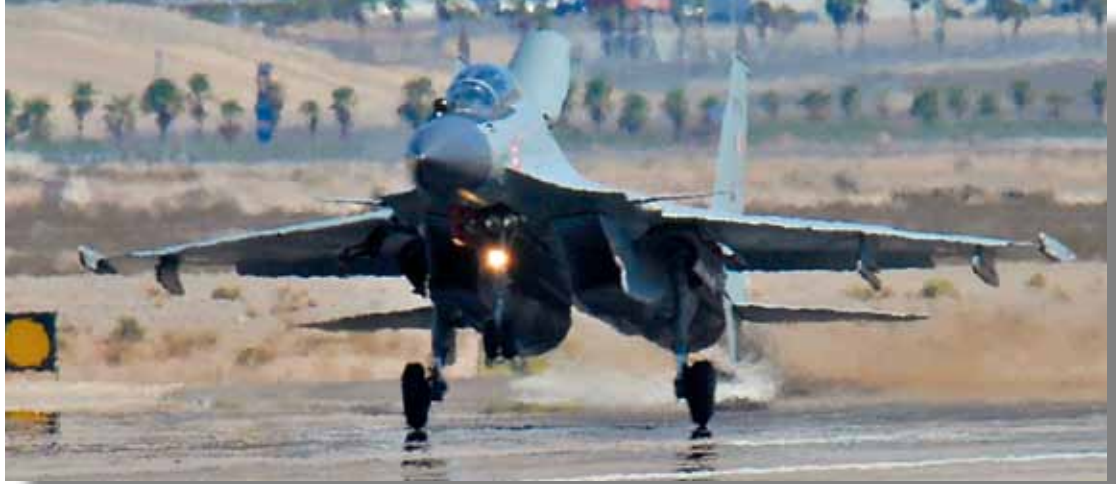
Indian Air Force Sukhoi Su-30MKI Flanker H.

THE strategic relationship between India and China, and its resulting manifestations in the Indian Ocean region are the subject of considerable strategic interest to Australia. Competitive strategic behaviour by both of these nascent regional superpowers will inevitably impact Australia's strategic position in the region by altering the regional balance of power and forcing adaptive behaviours and responses by smaller regional nations.