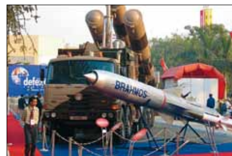
The supersonic Brahmos is an Indian evolution of the Russian Yakhont cruise missile, and will be manufactured in ground, sea and air launched variants.