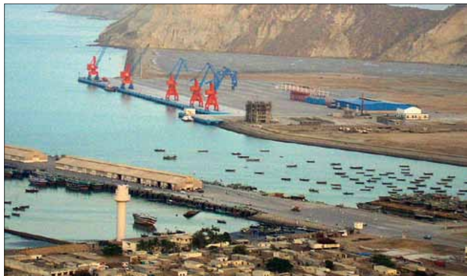
left: The deepwater port at Gwadar was constructed by China, and will be expanded into a military base.