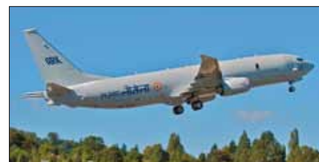
India's replacement of Soviet era LRMP aircraft with state-of-the-art Boeing P-8I Poseidon aircraft is a well considered strategic choice for India.