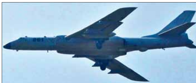
far left: China is developing a range of specialised ISR capabilities, including this Shaanxi Y-8GX4 electronic intelligence platform.