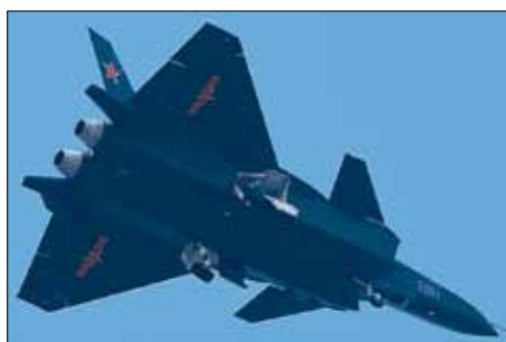
China's J-20 and India's FGFA based on the PAK-FA represent important advances in Asian air power.

One important difference against previous conflicts is China's Second Artillery Corps, equipped with a large inventory of highly mobile Intermediate Range Ballistic Missiles, especially the terminally guided DF-21C/D variants, and more recently, Ground Launched Cruise Missiles like the CJ-10 series.