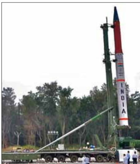
India's effort to develop the Agni series of ballistic missiles was a direct response to Pakistan's Hatf/Shahen series of ballistic missiles, derived from existing Chinese ballistic missile designs.

Africa remains an important market and source of raw materials for both Indian and Chinese industries, and both nations have been actively competing in propagating their influence in Africa.