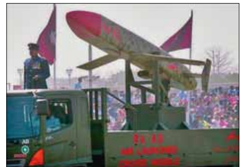
Pakistan's Babur GLCM and Ra'ad ALCM were both developed with Chinese assistance.