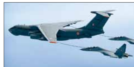
India's deployment of the Il-78 Midas tanker to support its Su-30MKI fleet is an important advance, but numbers of these aircraft are insufficient to confer significant strategic weight.

China's heavy involvement in the development of a large deep water port and shipping terminal in the Arabian Sea port of Gwadar in Balochistan, at the