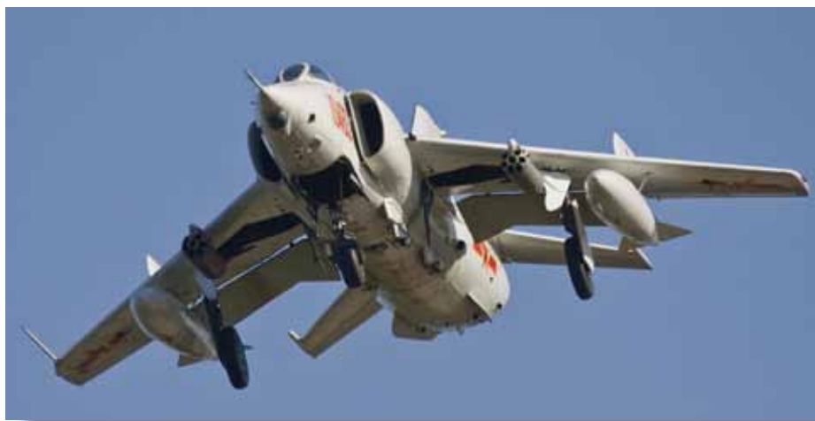
above: China has provided aid generously to both Pakistan and Myanmar. The now obsolete Q-5 Fantan was exported in large numbers as such.

Sino-Indian Relations, Journal of International Affairs, Vol. 64, No. 2, Spring/Summer 2011, School of International and Public Affairs, Columbia University.