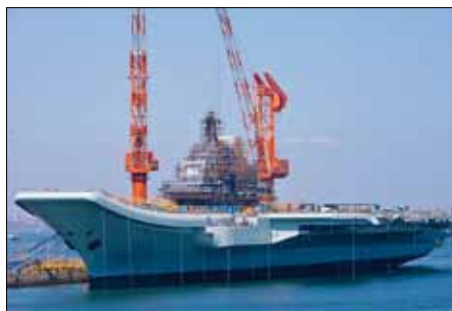
China's first aircraft carrier, rebuilt from the former Russian Varyag, is now undergoing sea trials.