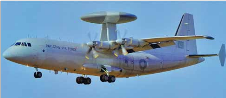
China recently supplied four CETC ZDK-03 Airborne Early Warning and Control systems to Pakistan, carried on Shaanxi Y-8 airframes. The systems compares closely to the C-130 AEW&C offered to Australia for the Wedgetail program a decade ago.

westernmost extremity of Pakistan's territory, has been interpreted as a likely future basing facility for PLA-N surface warships, and thus a military as well as economic play.