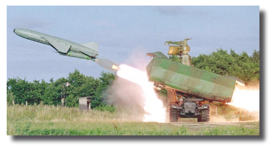
A key innovation introduced by the Soviets during the 1950s was the use of the high mobility 8 x 8 MAZ-543 as a TEL for ground launched cruise missiles, such as this 4K51 Rubezh system armed with the P-15 Styx antishipping missile.

With ongoing technological evolution, which will see better warheads, higher accuracy, longer range, lower radar and heat signatures and more intelligent and autonomous guidance, what is abundantly clear is that the headaches experienced by British air defence planners in 1944 attempting to defeat the FZG-76/V-1 will continue for modern force structure planners.