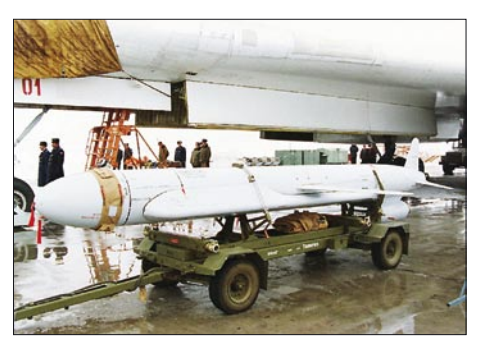
Modern cruise missiles like the US BGM-109G GLCM (upper) and Soviet Kh-55SM Granat (lower) produce much the same strategic effect as the FZG-76 did in 1944 – they force a "disproportionate response" in the deployment of air defence assets to stop them.