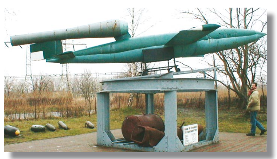
Fieseler FZG-76/V-1 on display in Germany. It was the first operational cruise missile and defined the "disproportiuonate response" strategy in use to this very day.

travelled down the tailpipe, the decreased pressure in the combustor would open the inlet valves and the cycle would be repeated. The Argus AS-014 pulse jet used in the FZG-76/V-1 was based on the Schmidt model, but it delivered barely enough thrust at 600 lbf to sustain the required climb rate