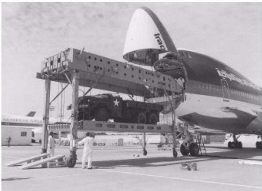
The Nose Cargo Door (NCD) has been an option on new-build 747 freighters since the 1970s. The NCD permits the loading of long payload items, either on pallets or in containers, and is especially useful for palletised vehicles and artillery pieces. Depicted is an Iraqi Airlines example equipped with an internal pallet loader (Boeing On-Board Loader), several of which were built two decades ago.

air is not feasible because, even if heavy aircraft could land at these bases, the tankers used would probably consume as much fuel as they could deliver. More importantly, in both strategic and tactical terms, most tanker-supported missions are likely to be flown from Darwin, Tindal and Learmonth because of the geographic spread of these three bases. All three are accessible for high-volume fuel resupply using land transport. All three have the runway quality to support a 747-400SF-based tanker without any limitations in basic fuel payload. A common criticism of the 747 as a tanker is that it requires more ramp space for parking compared to the KC-135 and twin-engine 767/A330 options. This might be an issue for the USAF and RAF who use their tankers mostly during coalition warfare in areas with often underdeveloped infrastructure. It is largely irrelevant for Australia. Even in coalition warfare Australia would be unlikely to deploy dozens of tankers (let alone own them). Used as an airlifter, the 747 would be interchangeable with the C-5 Galaxy in terms of ramp space needs overseas.