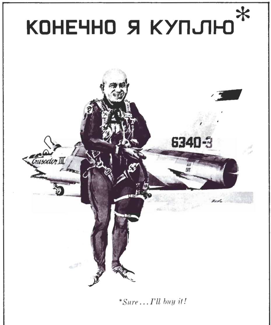
A choice was forced on the Navy — to terminate the F8U-3 despite the fact that the program had been highly successful.

The decision to select the McDonnell F-4 was reached primarily on the two vs. one man crew issue. It was generally accepted that a single pilot could do the job most of the time, but the two-man crew could do it better all of the time , with an advantage that widened with the severity of the threat. Thus, it was stated at the time that the day of the single seat fighter was over in the Navy and that none should be considered in the future. That design decision held for the next fifteen years, until the F-18 program returned to the