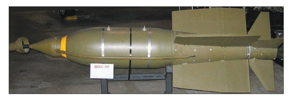
The Texas Instruments GBU-1/B "BOLT117" 750 lb laser guided bomb was the first such weapon to be used in combat, and proved highly successful (Wikipedia).