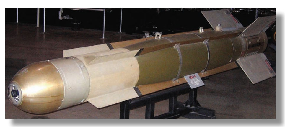
The Rockwell GBU-8/B 2,000 lb and GBU-9/B 3,000 lb HOBOS television quided bombs were used in the latter phase of the Vietnam war (Wikipedia).

The world had changed by the mid 1960s. The PAVN (People's Army of Viet Nam) was supported by large numbers of often highly skilled Warsaw Pact and Soviet instructors, and lavishly supplied with antiaircraft weapons by the Soviets and Chinese. The result was an air defence system across the north of Vietnam equipped with a density of Anti-Aircraft Artillery (AAA) pieces of all calibres which rivalled or exceeded the historical benchmark of Luftwaffe and Wehrmacht AAA defences during the 1944-1945 period. No differently, PAVN defences made extensive use of Soviet supplied SON-9/30/50 Fire Can / Fire Wheel / Flap Wheel gunlaving radars, and from 1964 onward deployed the S-75/SA-75 / SA-2 Guideline Surface to Air Missile (SAM) system. US aircraft had to deal with SAMs at high to medium altitudes, 57 mm, 100 mm and 130 mm AAA at medium altitudes, and barrages of 7.62 mm, 12.7