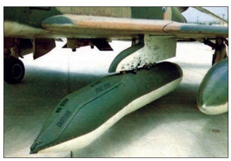
The Ford AVQ-10 Pave Knife laser targeting pod overcame the limitations of the earlier AVQ-9 Pave Light cockpit designators and was the preferred system in 1972.

more difficult problem. It was soon realized that increasing bombing accuracy from higher altitudes at higher speeds would be the most effective measure to overcome losses to barrage AAA.