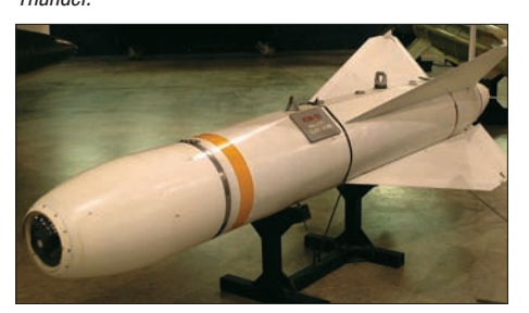
The 1,000 lb class AGM-62 Walleye I television guided bomb was the first "smart bomb" used in the Vietnam