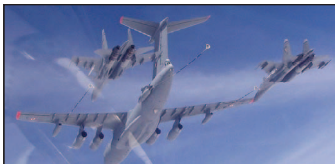
Indian Il-78MKI gassing two Su-30MKIs

In the long term, significant expansion of the PLA tanker fleet can be expected, as all of the late build Su-27SMK/J-11 Flankers and Su-30MKK/MK2 Flankers have refuelling probes, as does the new J-10 canard fighter. The PLA's options will be: conversion of the existing Badger fleet, production of a H-6K derivative tanker, or the purchase of further Midas tankers from Russia.