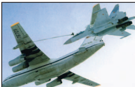
Russian Il-78 Midas gassing an Su-35.