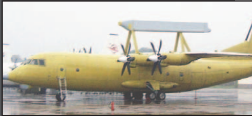
The KJ-200 or 'Y-8 Balanced Beam' AEW&C prototype

The PLA has two other AEW&C development programs under way at this time, with multiple photographs now circulating on the Internet.