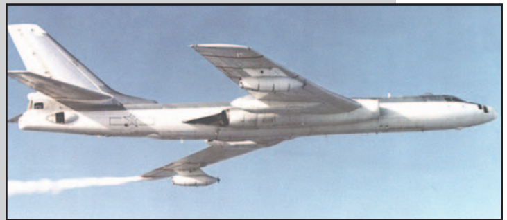
PLA-AF H-6U Badger, note the revised nose.