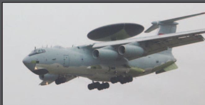
The PLA's new KJ-2000 AWACS prototype in the circuit at the Central Flight Test Establishment in Nanjing (via Internet).

Unsupported claims of an impending buy of the Russian Beriev A-50U or A-50E continued, until photographs emerged on the Internet during the 2003 period showing what was clearly an A-50-like AEW&C being flown from the Central Flight Test Establishment at Nanjing.