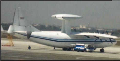
The Y-8 AEW&C prototype using a conventional radar and rotodome