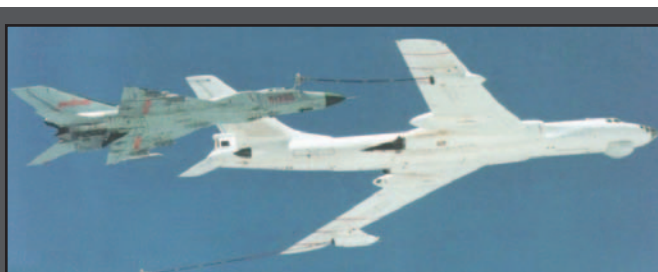
A PLA Navy H-6DU gassing a J-8C Finback.

The Il-78 Midas was the second generation of dedicated tanker to be introduced by the Soviets, replacing the very old Myasishchev M-4 tanker conversions operationally in 1987.