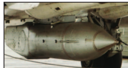
Sakhalin UPAZ-1A refuelling pod.