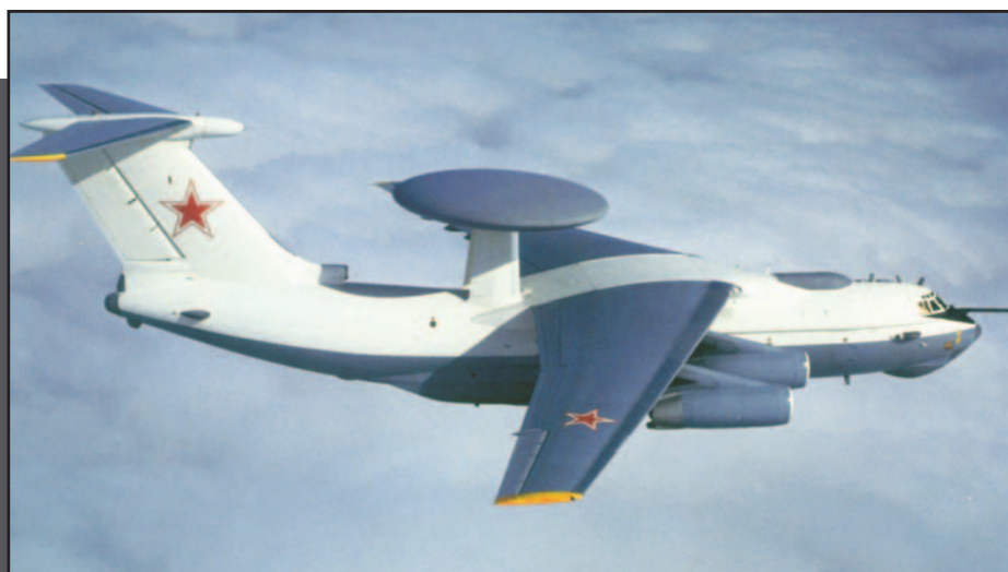
Beriev A-50E AWACS (Beriev)

The collapse of China's plan to acquire the Beriev A-50I AEW&C with the Israeli Elta Phalcon phased array radar was a significant setback for the PLA-AF, and was a loss of face globally to the US. The Chinese leadership vowed publicly they would get an AEW&C capability.