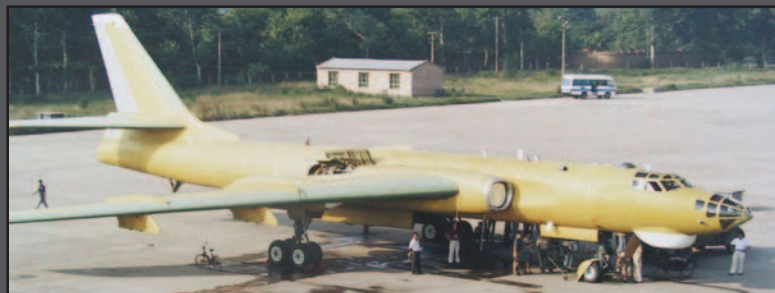
New production PLA-AF H-6M cruise missile carrier. The follow-on H-6K has a turbofan engine.

The Il-78 is a conversion of the Il-76 Candid airlifter airframe, conceptually not unlike the USMC KC-130 tankers. Around 80,000 lb of auxiliary fuel is carried in two large fuselage tanks, mounted on fixed pallets carried on the main freight deck. While the earliest Midas tankers were reported to be dual role 'convertibles', indications are that more recently built aircraft are dedicated tankers, with a single large fuselage tank for auxiliary fuel.