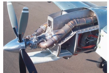
Top view of turbine installation showing nacelle details, relative reduction in size compared with R2000 radial piston engine and ease of access for maintenance of installation.

With a fleet of Turbo Caribous the effective strength of No 38 Squadron would be increased by over 25% as the achievable 96% availability would permit a significantly higher flying rate and rate of sortie completion against that currently being achieved by the legacy R2000-powered fleet. Should more Caribous be sought, refurbished aircraft modified to the Turbo Caribou configuration would be a credible option. With several refurbished Caribous used for the initial in-country conversions, there would be no loss of aircraft availability at the outset of any conversion program.