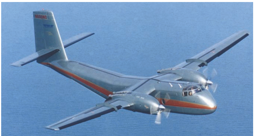
Pen Turbo modified “Turbo Caribou”, N600NC, flying off Cape May, New Jersey in the USA. The aircraft has accumulated over 500 flying hours. Completed a function and reliability trip in June 2000 - over 7,000 nm flown in 51.4 hours; average fuel consumption - 910 lbs/hr; total oil consumption - 1.5 qts per engine; no discrepancies; only tooling used - “a screwdriver to service fuel and oil”. (Pen Turbo)