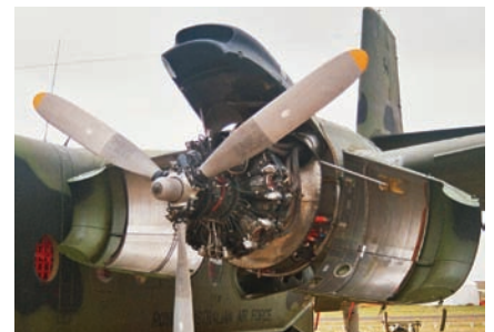
R2000 engine installation on RAAF Caribou showing the large, 13-foot diameter, 3-bladed propeller and enormous bulk of the R2000 radial piston engine.

The PT6A-67T has a takeoff rating of 1420 SHP with an emergency rating of 1560 SHP and a max cruise rating of 1200 SHP, with an achievable TBO of around 6000 hours. The Hartzell prop is a more modern design, with a higher disk loading than the legacy prop. It is rated for a 1600 SHP engine, providing a robust margin in deliverable thrust over the service life of the prop. The five-bladed (as opposed to three) smaller diameter propeller is better suited to operations on unprepared runways, and the smaller thrust cone means less prop wash impingement and, therefore, lesser stresses on the tailplane.