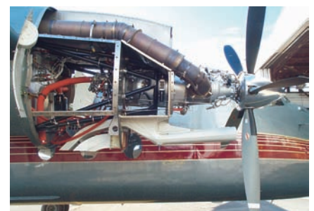
Side on view of turbine installation showing air intake, plenum and exhaust details as well as the engine mount and spaciousness of the engine bay.