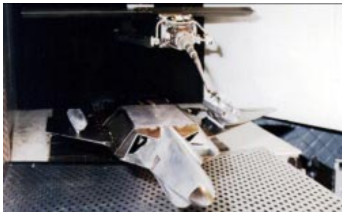
The F/A-22A is not just a dedicated and specialised air superiority fighter – the US Air Force Global Strike Task Force will use its F/A-22A component mostly for trucking smart bombs. Depicted (top) is USAF AEDC wind tunnel testing of a developmental external stores pod for the F/A-22A, intended to reduce the radar signature of additional external bomb payloads. The jack of all trades JSF is part intended to replace the A-10A and AV-8B Harriers in close air support roles (bottom), and is not optimised to fulfil 'air control' or 'air dominance' roles.

Another growth issue will be available internal volume for avionics, and especially waste heat management capacity. Any increases in ICP capacity and AESA power rating will be reflected in significantly greater waste heat to be dumped from the systems, already reported to be an issue at this stage. Again, for US users targeting interdiction and support roles avionics growth limits may be largely irrelevant – more radar range and a larger information gathering footprint are not critical factors. For Australia, competing with Sukhoi in air combat roles, and using the JSF to provide ISR and long range strike capabilities, growth will be a decisive issue.